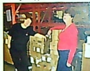
Finishing a hefty job

The Willow Awards board thanks the over 11,000 voters for the 2009 winners and encourages even more children to read the nominees and vote for the 2010 winners.