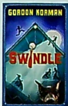
Gordon Korman Swindle