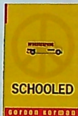
Gordon Korman Schooled