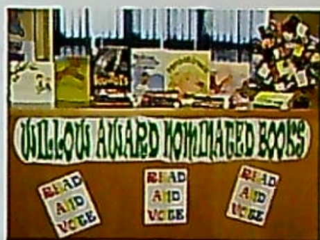
One Launch Submission

Once again this year, schools around the province were invited to host their own Willow Awards Launch. Participating schools submitted summaries of their Launch activities and projects that included photos, posters, PowerPoints, Smart Board activities and links to their blogs.