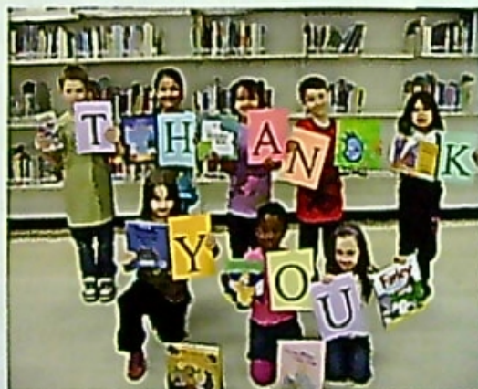
Students from Caroline Robins School in Saskatoon