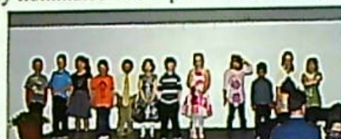
Students of Saltcoats Elementary School