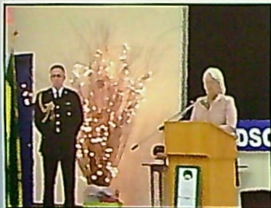
Lieutenant Governor Vaughn Solomon Schofield